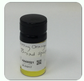
The photos on this report are of a sample collected by the lab and may vary from the final packaging.