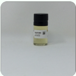
The photos on this report are of a sample collected by the lab and may vary from the final packaging.